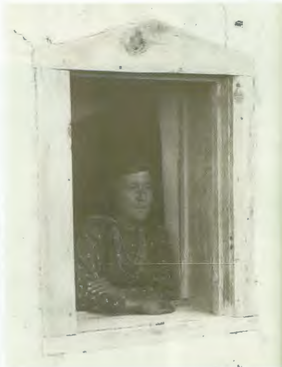
Young Isleta Girl in window