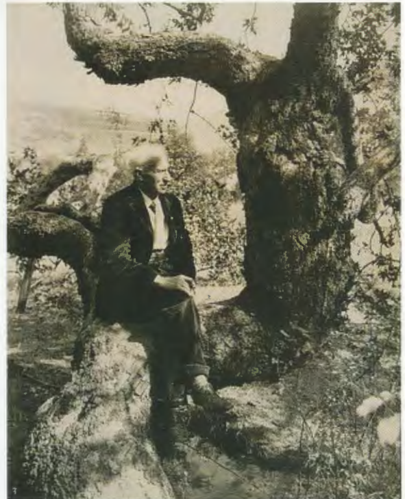
Photograph of Charles Lummis sitting on tree trunk, 1928.

The great four-branched sycamore that Lummis called "El Alcalde Mayor" is no longer sheltering the house as it did originally. Despite the efforts made by Lummis to "doctor" the tree, it was a dangerous derelict for years. On September 15, 1898, he notes in his diary that he played dentist to the tree, putting 16 fillings into cavities in the great trunk. Today we have scions of the old patriarch, four saplings springing from the deep roots and waving bright green leaves above the house. Behind the kitchen wall is another notable sycamore grown to magnificent girth since Lummis' day.