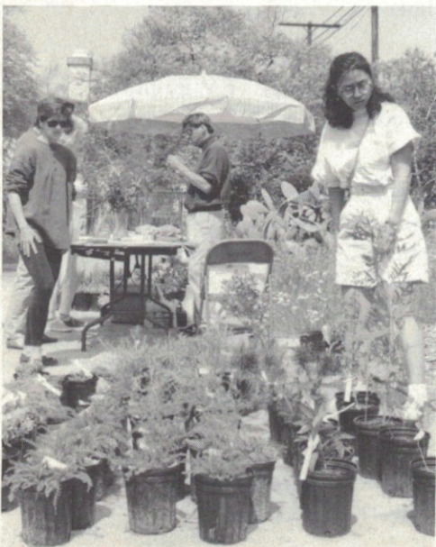
Hot-selling native plants from Theodore Payne Foundation.