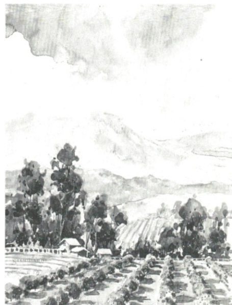
Letters From the Orange Empire