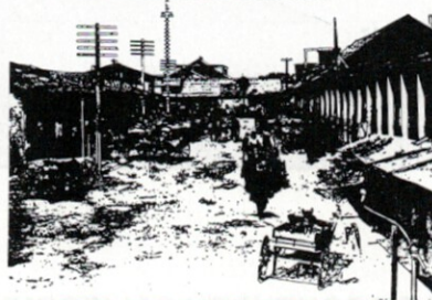
The Los Angeles Barrio 1850-1890