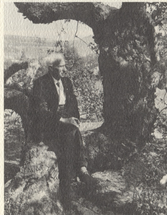
The lazy days of summer