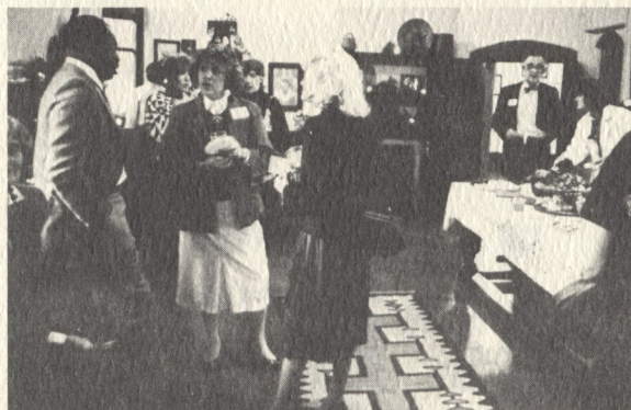
Docents, Holiday Open House, El Alisal

At our Holiday Reception in December, we enjoyed the ambience of a festively decorated El Alisal complete with a member decorated tree, luminarias, and holiday cheer. Our many volunteers were introduced, and members were able to meet these dedicated people who keep the garden in good repair and explain the Lummis Home to visitors.